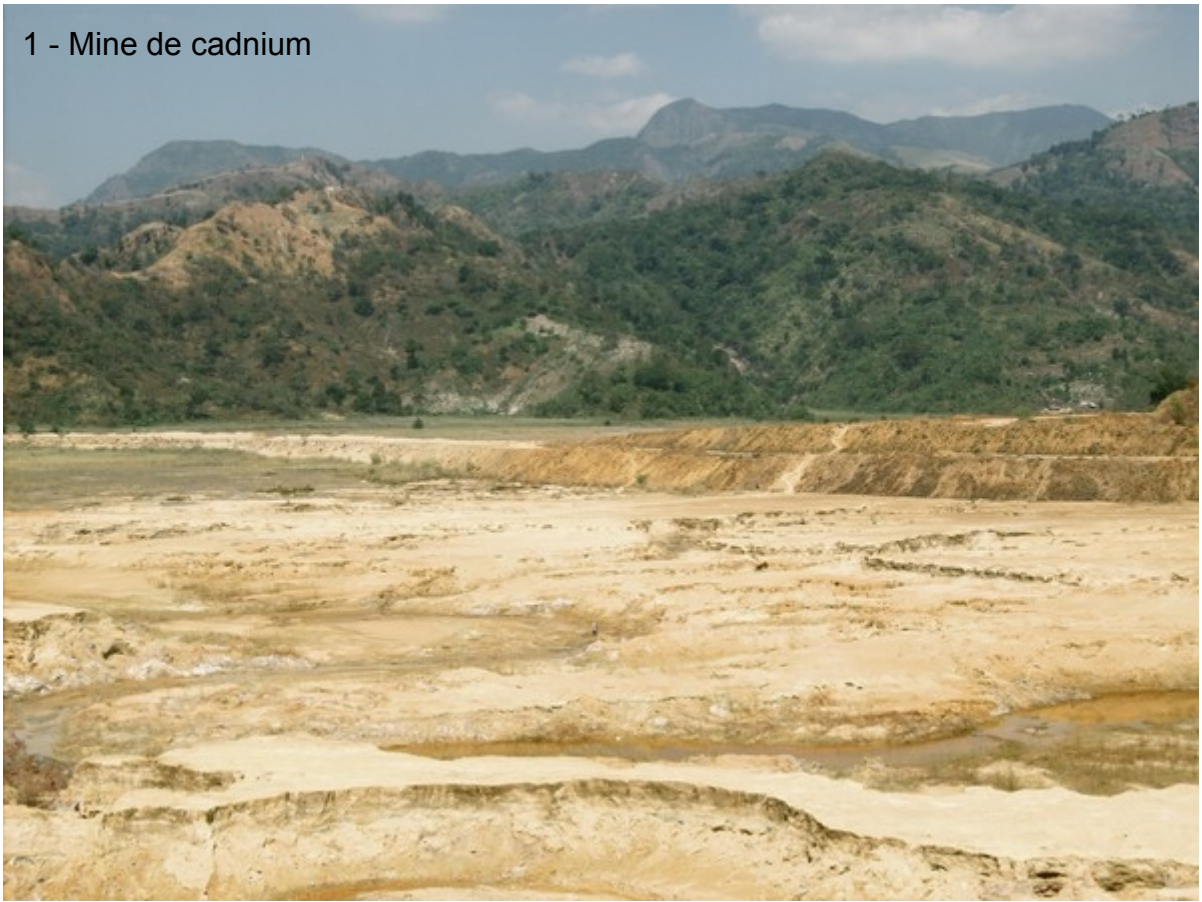
1 - Mine de cadmium